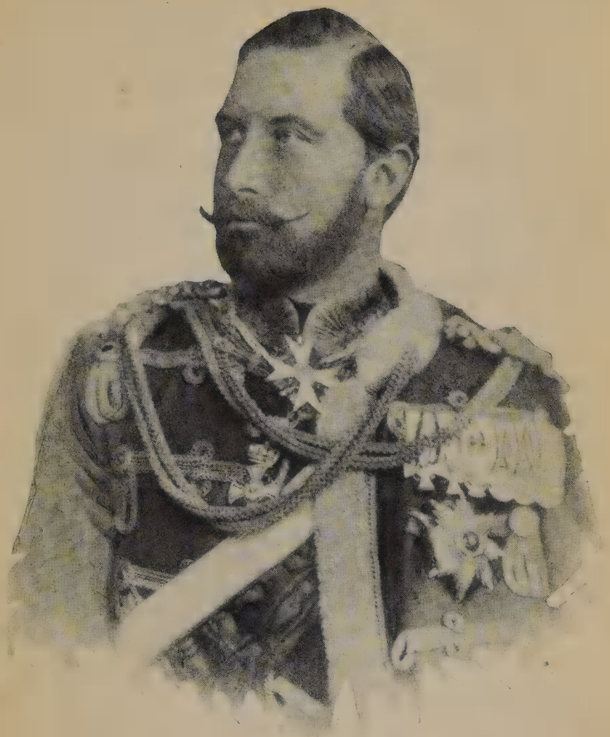
A SUPPRESSED PHOTOGRAPH OF THE KAISER TAKEN WHEN HE WAS EXPERIMENTING WITH A BEARD